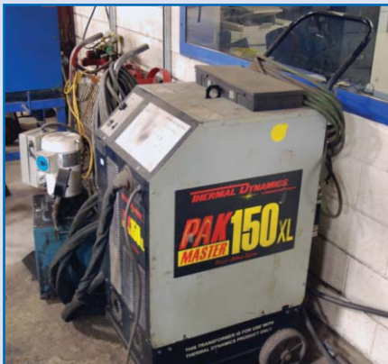
THERMAL DYNAMICS PAK MASTER 150XL PLASMA CUTTER