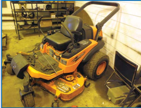
KUBOTA LAWNMOWER MODEL ZD326S-60

This brochure is meant merely as a guide. Infinity Asset Solutions makes no guarantee, expressed or implied, as to the accuracy of the information in this brochure. Buyers should inspect the goods beforehand to satisfy themselves.