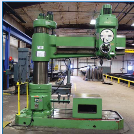
POBEDA 6' RADIAL DRILL, MODEL RB 70-1600