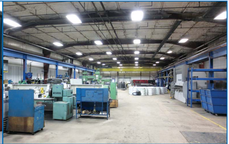
LAND & BUILDING – WELDING SHOP, 80 INDUSTRIAL PARK, MINTO, NB (PARCEL B)