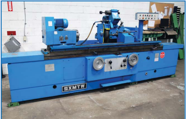
SXMTW 5' CYLINDRICAL GRINDER