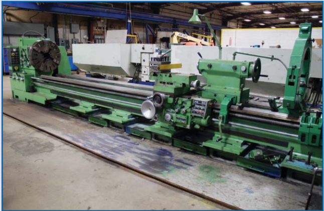
POREBA 38" X 20' LATHE MODEL TPK 90A175M