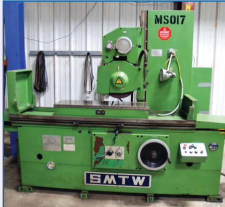
SMTW 12" X 36" SURFACE GRINDER