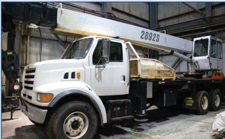
FORD 20' FLATBED, 20' 4 STAGE BOOM