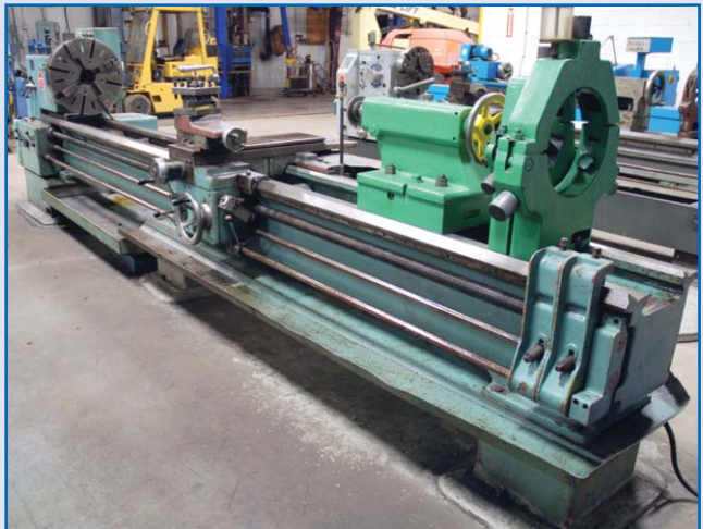
TOS SN 71B LATHE, 28" X 15'