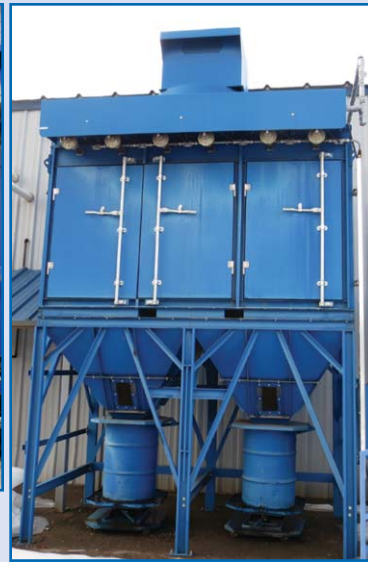
PLYMOVENT DUST COLLECTOR SYSTEM, PLUS 12 FLEX HOSES