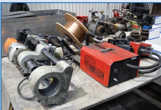
BORTECH PORTABLE LINE BORING SYSTEM, MODEL 306-P