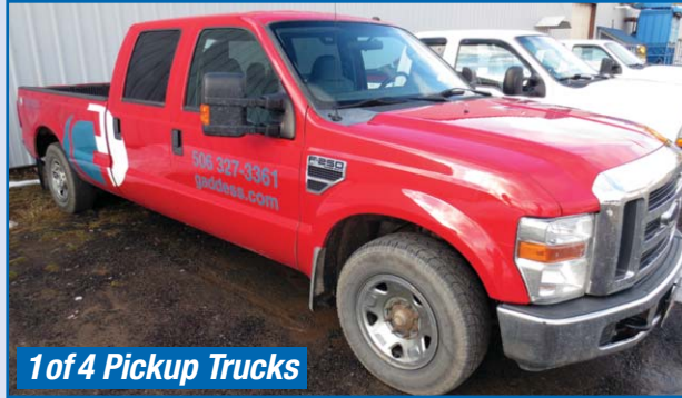
FORD F250 XLT SUPER DUTY