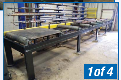
HYD MECH V-18 Series II Tilting Vertical Band-saw, 18" Throat, 1-1/4" Blade, Chip Conveyor, Laser, Coolant, Dual Power Vise, sn J0710364, Plus 3'x8' Outfeed Conveyor