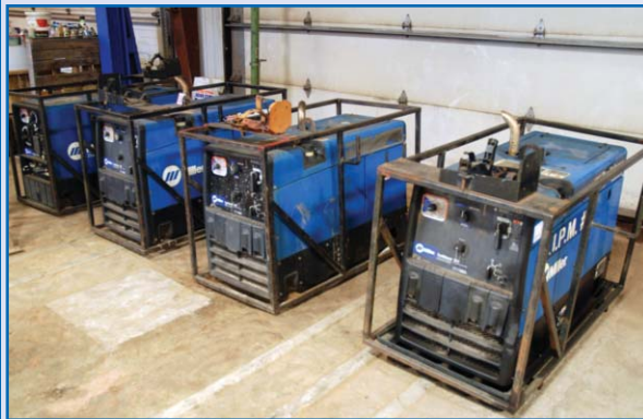
MILLER TRAILBLAZER GAS WELDERS