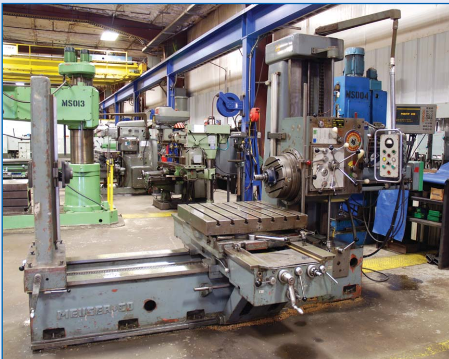
MEUSER Boring Mill Model M55BF, Travels: 44"x57", 33.5"x33.5" Rotary Table, 15" Face Plate, Morse 3.5" Spindle, Vertical Head Attachment, Tailstock, Heidenhain Positip 855 3 Axis DRO, Pendant Control, Max 1,800 RPM, sn 37353