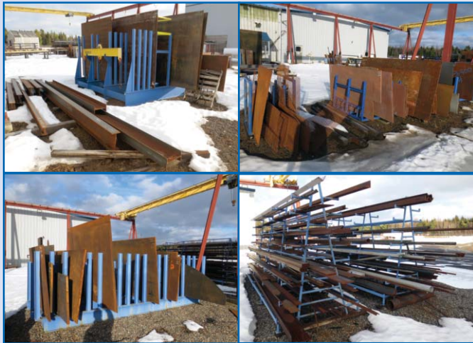
PARTIAL VIEW OF ASSORTED RAW MATERIAL