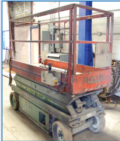
SKYJACK SCISSOR LIFT