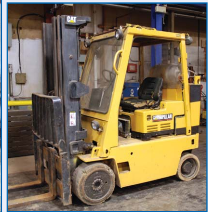
CATERPILLAR 8,000 LB CAP. FORKLIFT