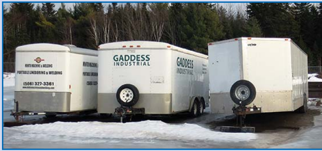
VIEW OF TRAILERS – UP TO 24'